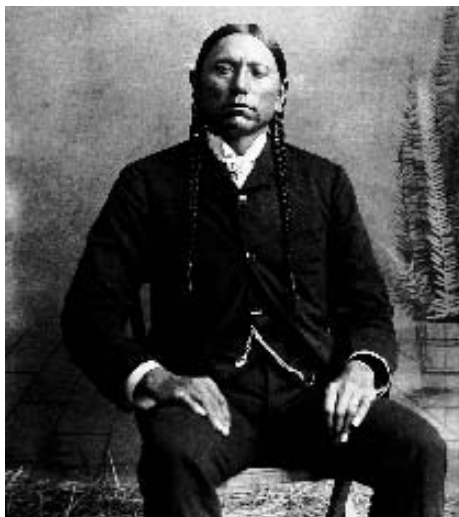
Chief Quannah Parker, citizen's garb, modern gelatin silver print from original glass plate negative, ca 1888-1891