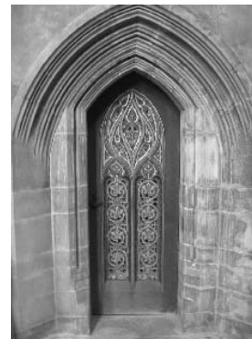
An ornate interior door