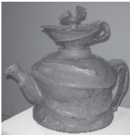
Below: Pot 101; Ichiro Matsuo; 2010; Ceramic.