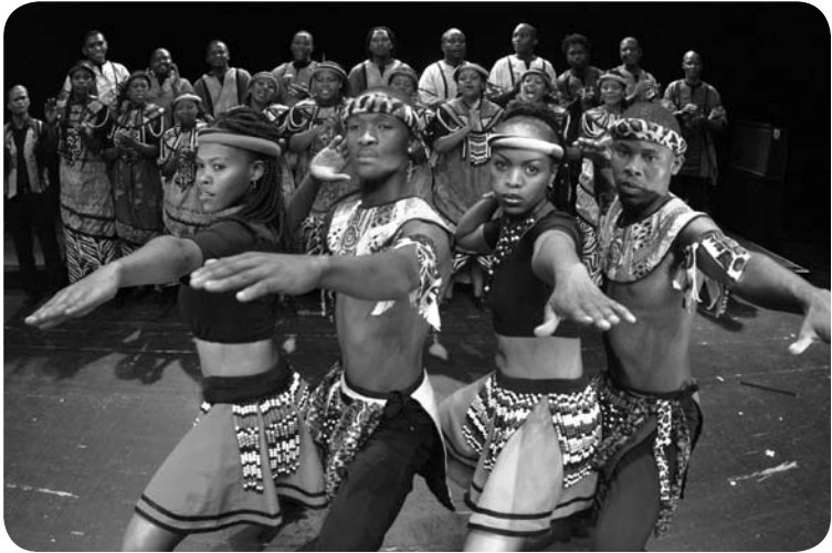
The Grammy-Award winning Soweto Gospel Choir (above) will appear at the Zellerbach Theatre, Annenberg Center on January 30. This South African ensemble performs tribal, traditional and popular African gospel in eight different languages.