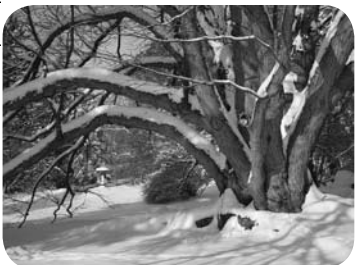
Above: At the Morris Arboretum, a snow covered Katsura tree, which are native to Japan and China and known for their delicate heart shaped leaves and bright autumn colors.